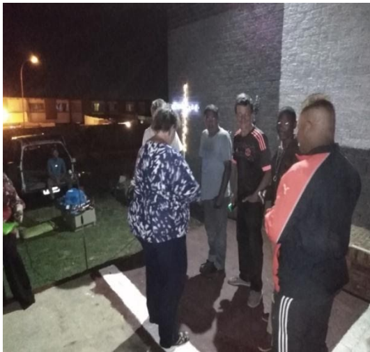
Some of the men receiving their special gifts.