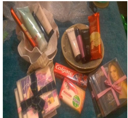
An example of two gift parcels.

This is our team of kids who are being trained to bring the Gospel through dance and drama. They delivered the most beautiful mimes and we are very proud of them!